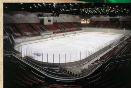
Regulation Ice for Hockey or Skating Events