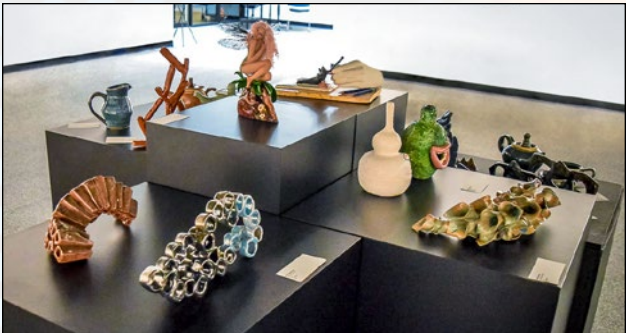
Polk State Arts Day 2016 - Student Artwork

GALLERY EXHIBIT Printmaking Invitational Polk State Winter Haven Fine Arts Gallery