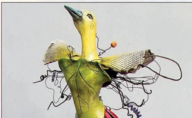
Madeline by Marilyn Rackelman

Sponsored by the Lake Wales Arts Council Polk State Lake Wales Arts Center