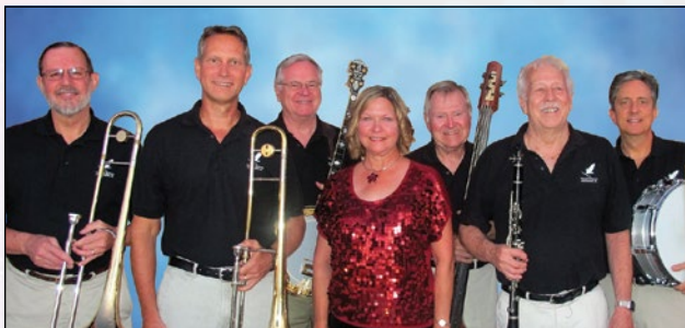
The New Orleans Nighthawks