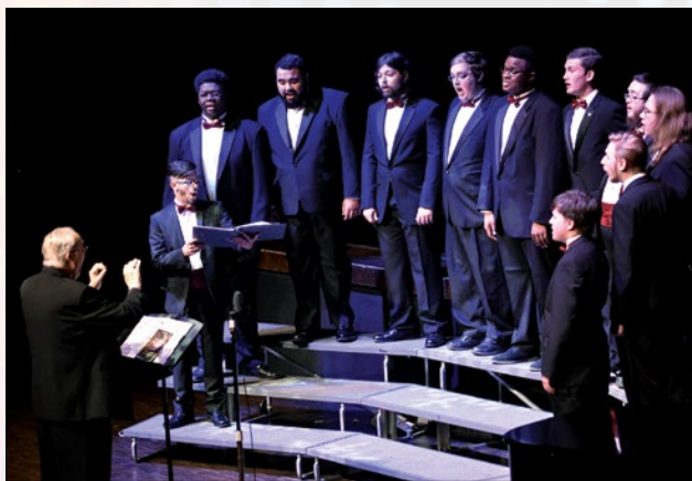
2016 Polk State Choir performance