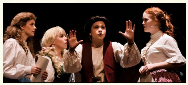
Fall 2015 Polk State Theatre Production of "Little Women - The Musical"

Polk State Winter Haven Fine Arts Gallery