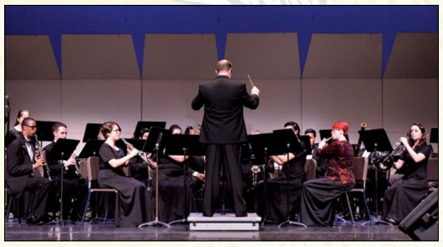
Polk State Symphonic Band