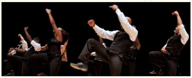
STEP AFRIKA! Exciting contemporary dance genre dedicated to the tradition of stepping.