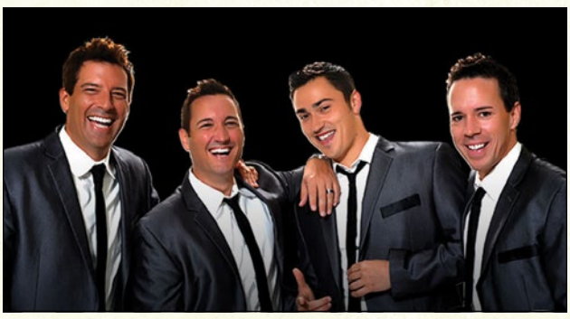
Atlantic City Boys