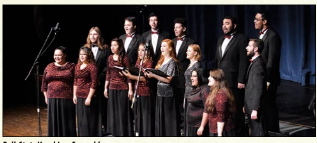
Polk State Vocal Jazz Ensemble

Polk State Winter Haven Fine Arts Theatre