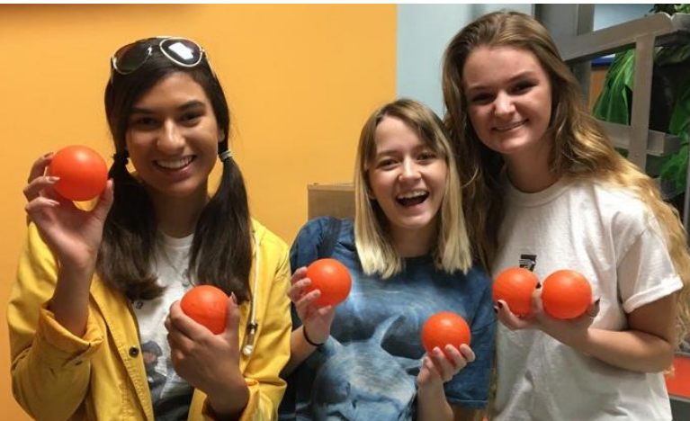
Left and below : our students enjoyed their trip to Children's Exploration 5 Museum with Student United Way to learn about volunteer opportunities