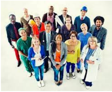
Trade, Workforce, College, Military, we can PREPARE YOU!