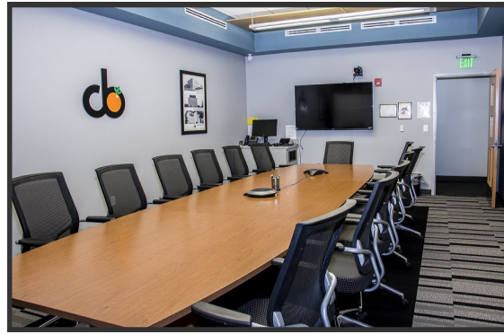
Citizens Bank and Trust Boardroom (Top) Warming Kitchen (Bottom)