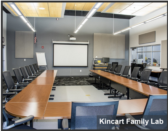
Kincart Family Lab