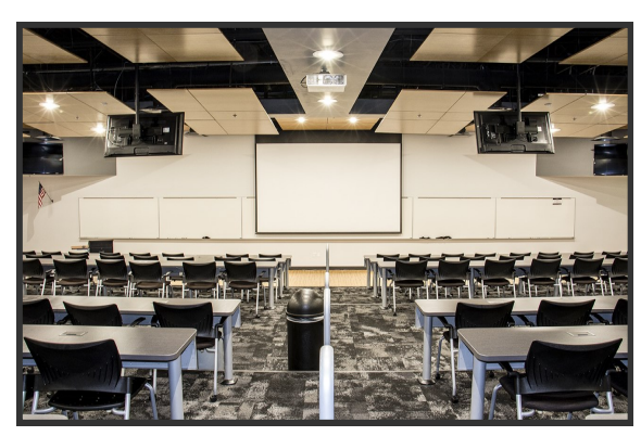
MOSAIC Auditorium Front (Top) MOSAIC Auditorium Back (Bottom)