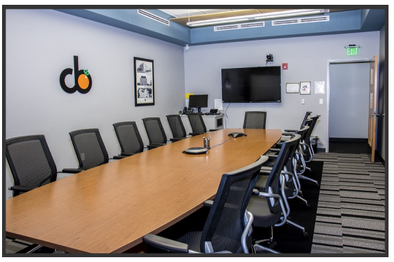
Citizens Bank and Trust Boardroom (Top) Warming Kitchen (Bottom)