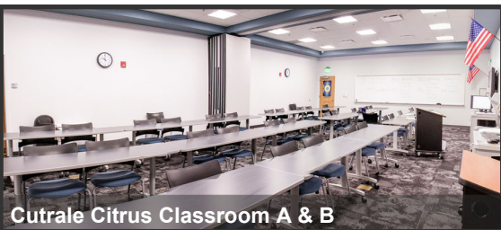
Cutrale Citrus Classroom A & B Shown with seating for both sides