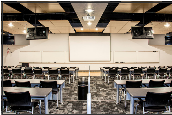
MOSAIC Auditorium Front (Top) MOSAIC Auditorium Back (Bottom)