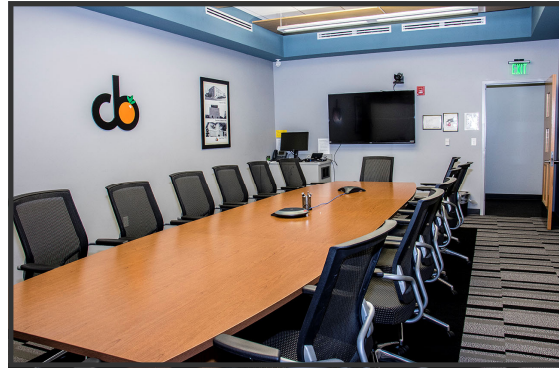
Citizens Bank and Trust Boardroom (Top) Warming Kitchen (Bottom)